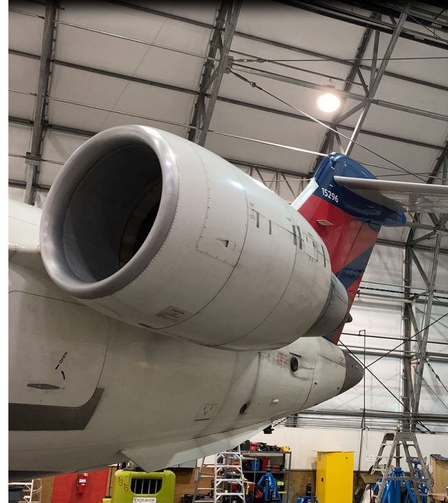
CRJ-900 Endeavor Air