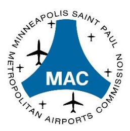
Media Release November 9, 2023