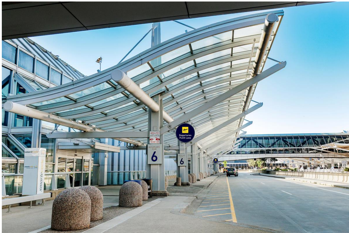
MSP’s Terminal 1 FLEX Lane offers an additional zone for passenger drop-offs and pick-ups.

In time for this busy MEA travel period, MSP opened a new FLEX Lane at Terminal 1 to provide an additional zone for passenger drop-offs and pick-ups.